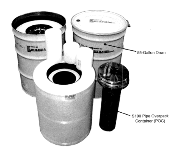
55-Gallon Drum Volume: 0.21 m3

S100 Inner Container Volume: 0.00163 m³ (~1% of 55-Gallon Drum Volume)